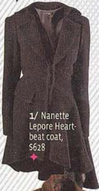
1/ Nanette Lepore Heart-beat coat, $628