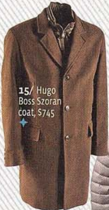
15/ Hugo Boss Szoran coat, $745