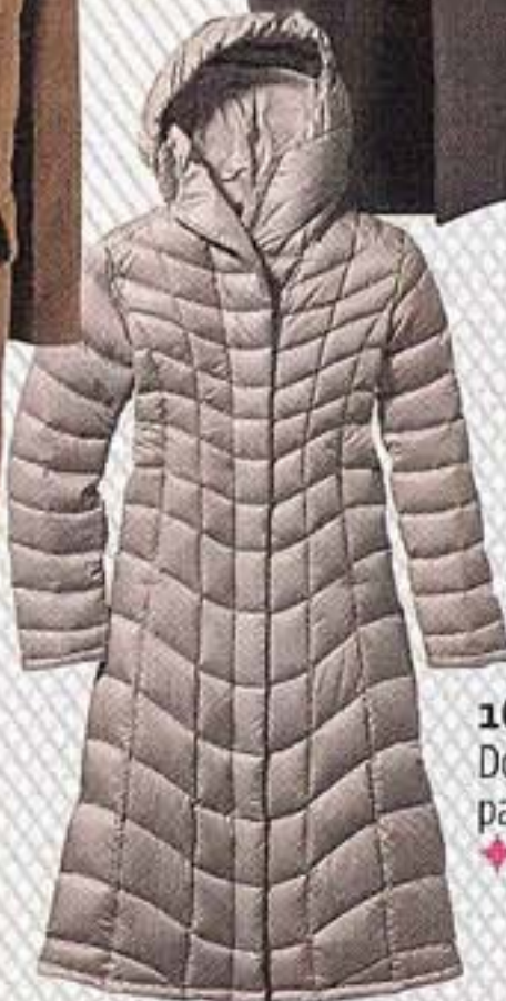
16/ Patagonia Downtown Loft parka, $350