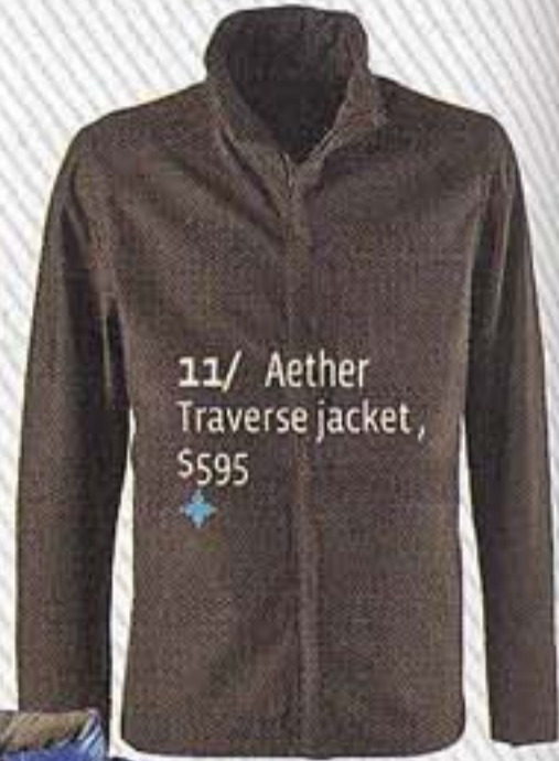
11/ Aether Traverse jacket, $595