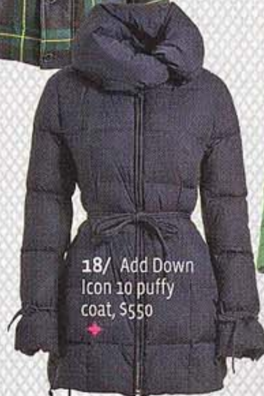
18/ Add Down Icon 10 puffy coat, $550