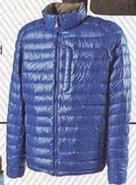
12/ Lands' End Snowpack 700 down jacket, $99.50

Well Insulated We ranked 22 new coats by their ability to brave the elements BY REBECCA LITTLE