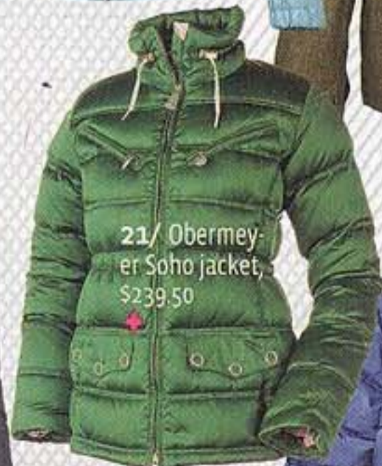
21/ Obermeyer Soho jacket, $239.50