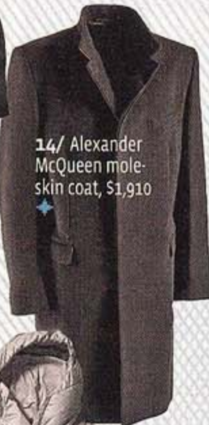
14/ Alexander McQueen moleskin coat, $1,910