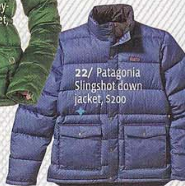
22/ Patagonia Slingshot down jacket, $200