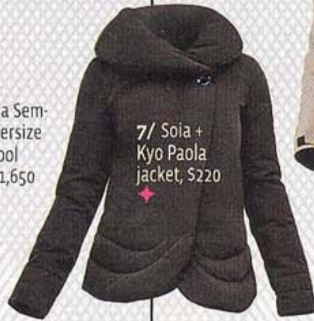
7/ Soia + Kyo Paola jacket, $220