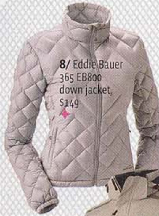
8/ Eddie Bauer 365 EB800 down jacket, $149