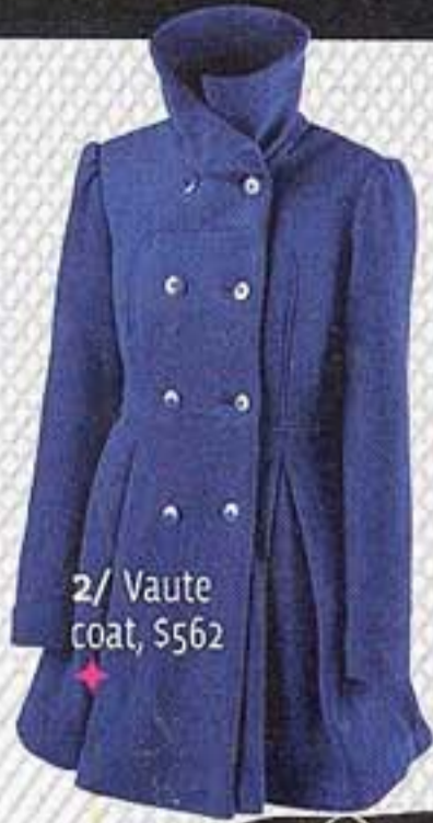
2/ Vaute coat, $562