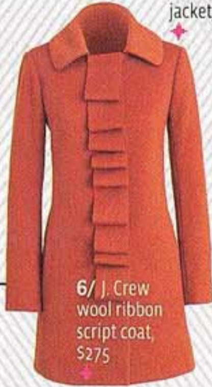
6/ J. Crew wool ribbon script coat, $275

Well Insulated We ranked 22 new coats by their ability to brave the elements BY REBECCA LITTLE