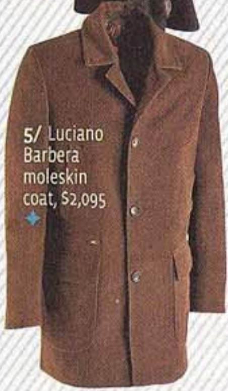
5/ Luciano Barbera moleskin coat, $2,095