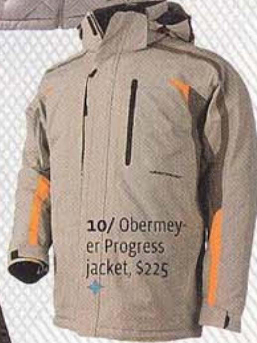
10/ Obermeyer Progress jacket, $225