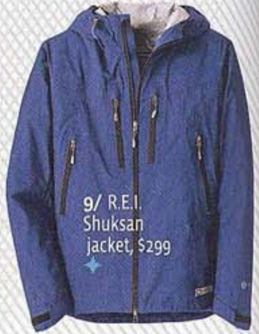
9/ R.E.I. Shuksan jacket, $299