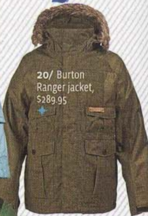
20/ Burton Ranger jacket, $289.95