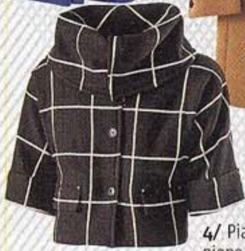
4/ Piazza Sempione oversized check wool jacket, $1,650