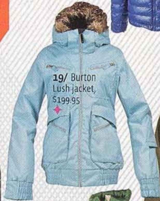
19/ Burton Lush jacket, $199.95