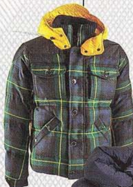
17/ Moncler Defense coat, $1,575