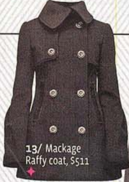
13/ Mackage Raffy coat, $511