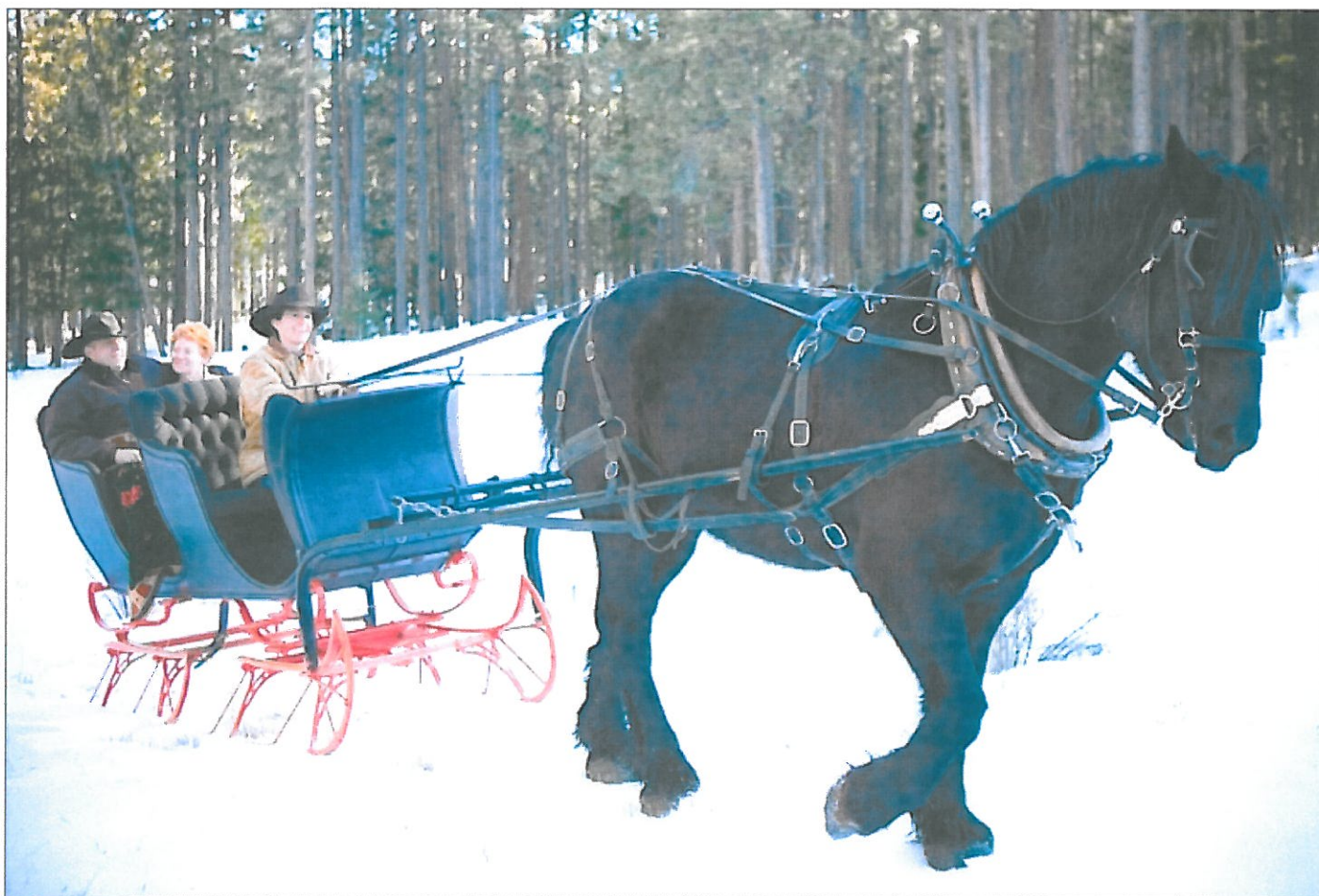
A couple enjoys a sleigh ride among beautiful winter scenery at the Hidden Meadow Ranch near Greer.