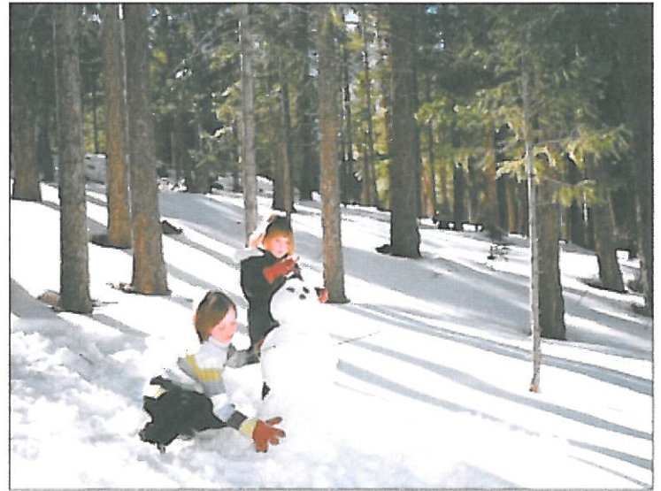
Above, two young guests have fun in the snow. At left, a totem pole sign directs visitors.