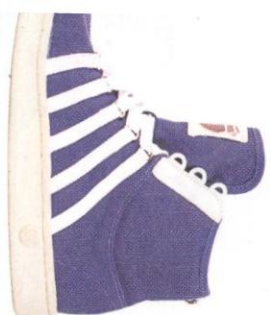
beat poet photographed by bradford.gregory. grooming: anna.bernabe for davines. model: clinton at dna. coat, cardigan, and shirt by beat. post. still lifes by bon.duke. nike illustration by aisha.youssaf.