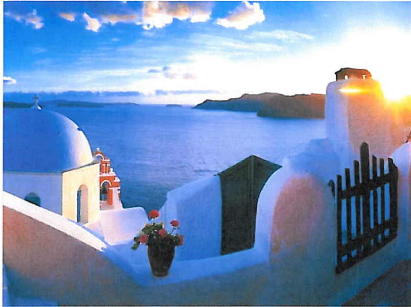
The sun rises on an island in Greece.

Tours of a Lifetime Home Africa Asia Central and South America Europe North America Oceania Photos Best Deals