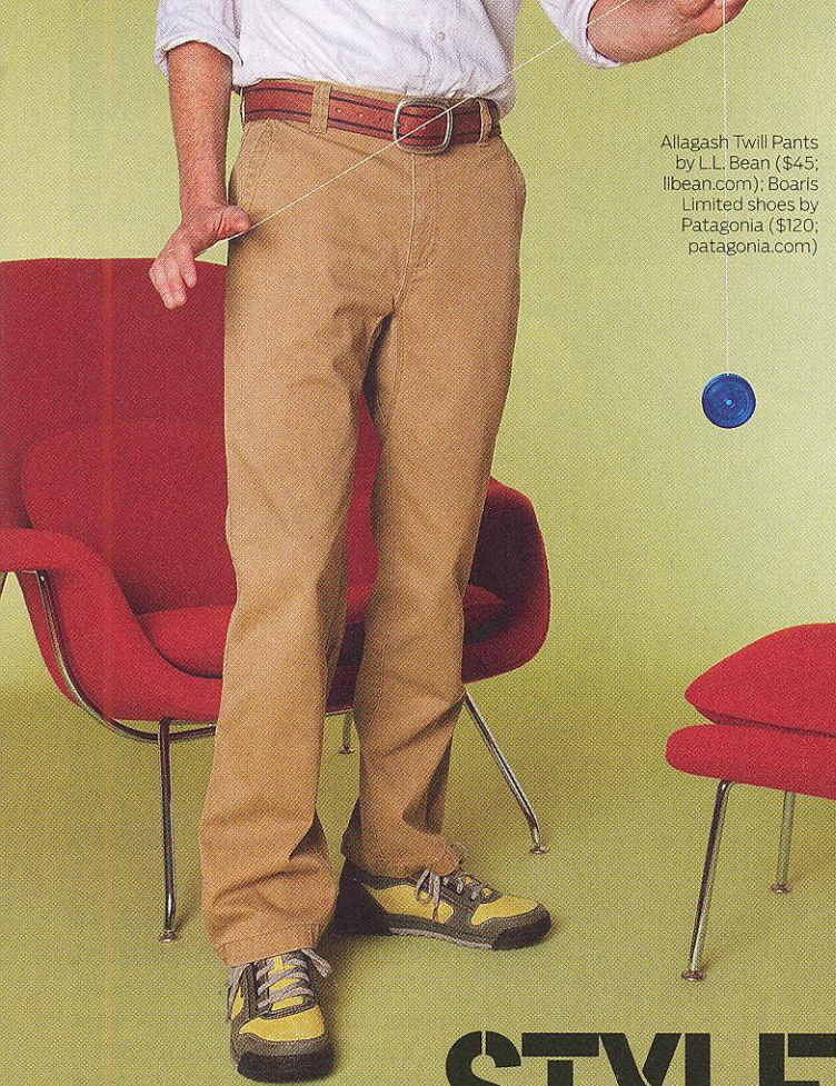
Allagash Twill Pants by L.L. Bean ($45; llbean.com); Boaris Limited shoes by Patagonia ($120; patagonia.com)