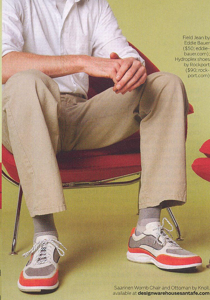
Field Jean by Eddie Bauer ($50; eddiebauer.com); Hydroplex shoes by Rockport ($90; rockport.com)