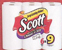
Cleanup Done Right Towels

From the kitchen to the bathroom, all Scott® products are Done Right.