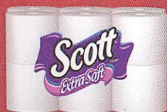
Softness Done Right Extra Soft Tissue