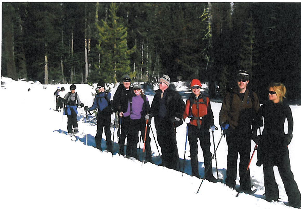
BOTTOM

Shake off the winter blahs—or those last few holiday pounds—by attending REI Outdoor School's snowshoeing classes, where instructors go over everything from how to pick out the right equipment to proper technique, then take you snowshoeing. The cost of the class—$25 to $70—covers transportation, park fees, area maps and first-aid kits. Want to learn about snowshoeing but aren't quite up for a trip to the snow? Try the in-store Snowshoeing Basics class. For more information, call your local REI store or log on to rei.com.