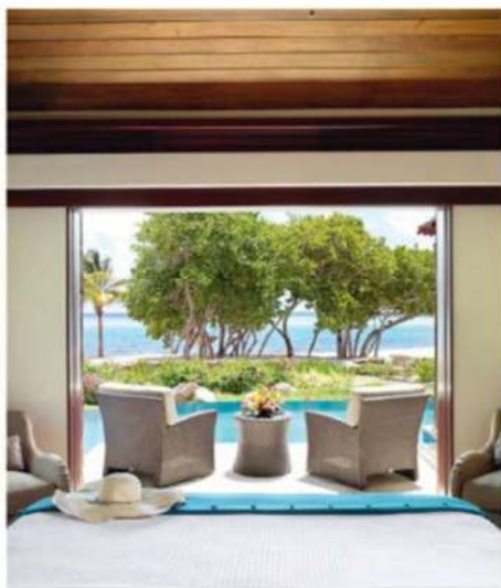
Other images: The properties on offer at Oil Nut Bay – Beach Club (above); Jewel Box (left and below).

Smeralda, a short hop along the island from Oil Nut Bay. This new facility is capable of hosting yachts up to 100 metres, and it’s this combination of destination, residential property and superyacht base that makes for something unique in the Caribbean.