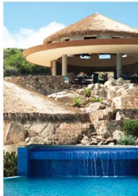
Above left: How the Yacht Club Costa Smeralda Virgin Gorda will look on completion in the spring.

Almost a decade on, Oil Nut Bay is now coming to fruition. Victor International is also developing the YCCS Virgin Gorda, in partnership with the Yacht Club Costa