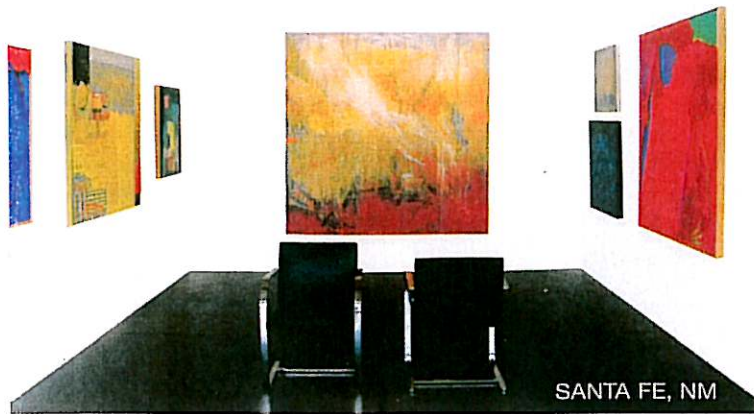
SANTA FE, NM

[SANTA FE] One of Santa Fe's oldest and largest art galleries, the LewAllen Gallery is opening its first branch gallery at Encantado, a new Auberge resort in the foothills of the Sangre de Cristo Mountains. LewAllen's tradition of showcasing the best in contemporary art continues here, with a broad range of styles and media including painting, sculpture, photography, prints, glass and ceramic art, and fine art jewelry. 505-946-5778, lewallencontemporary.com