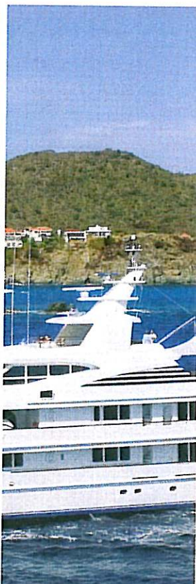
Frasers Yachts: Paradise , $385,000 plus expenses per week; call +1.772.7118 or visit frasersyachts.com .