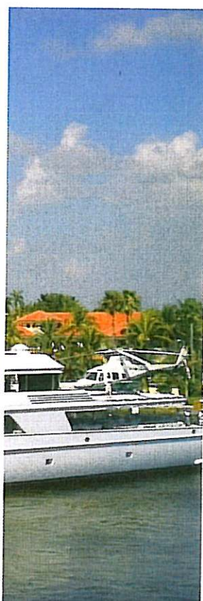
International Yacht Collection: Floridian , $400,000 plus expenses per week; call 888.213.7577 or visit yachtcollection.com .