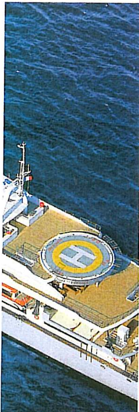
Camper Nicholson: Annaliese , $853,335 per week; call 954.524.4250 or visit enconnect.com