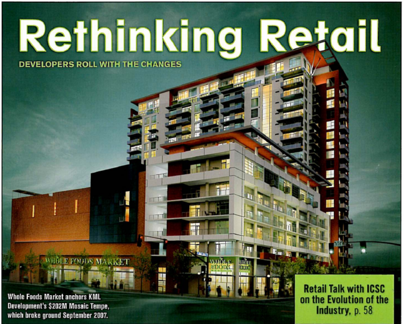
Whole Foods Market anchors KML Development's $202M Mosaic Tempe, which broke ground September 2007.

Retail Talk with ICSC on the Evolution of the Industry, p. 58