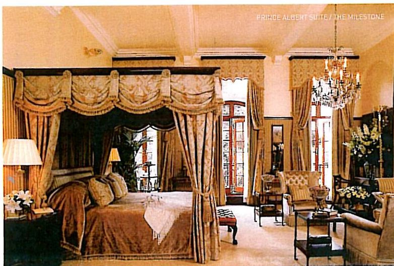
PRINCE ALBERT SUITE / THE MILESTONE

Email: apike@rchmail.com ; Website: www.milestonehotel.com